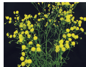
Narrow-leaved hawk's beard