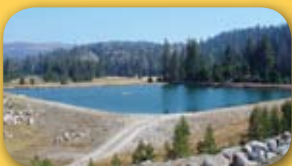
Bear Valley Water District Secondary Wastewater

Cuts turbidity up to 70% and at half the cost of Dissolved Air Flotation.