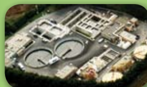
Sewer Authority Wastewater Treatment

Delivers stable filtrate to ultrafiltration with Zero fouling and backwash.